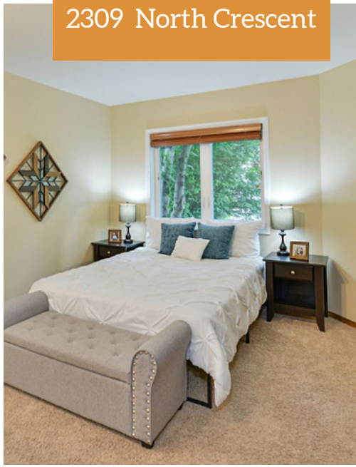
Right Sized Bedrooms with Plenty of Closet Space

ACCOMODATION FEE $344,200 SERVICE FEE INCLUDES MAINTENANCE AND GROUNDS KEEPING