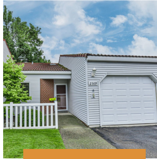
2309 North Crescent