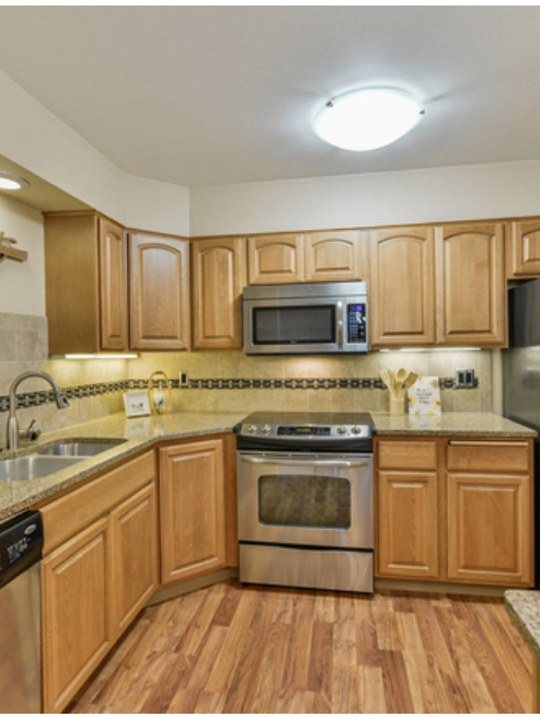
Updated Appliances, Back Splash and Counter Tops