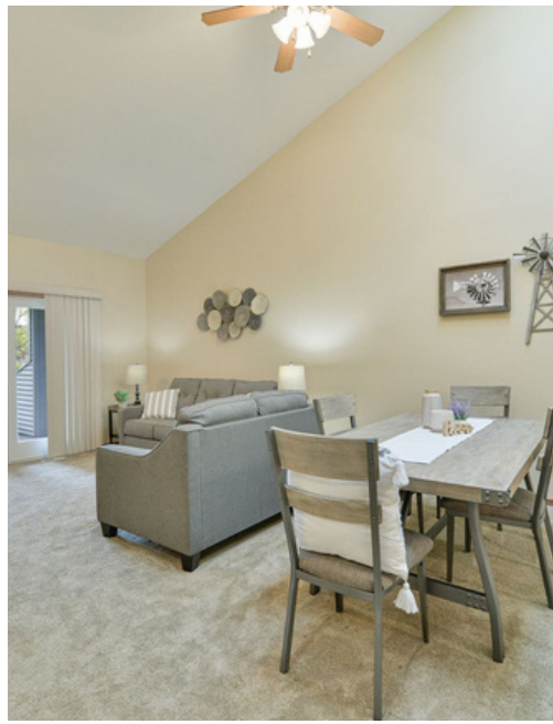
Large Living Area, with Vaulted Ceiling and Skylights