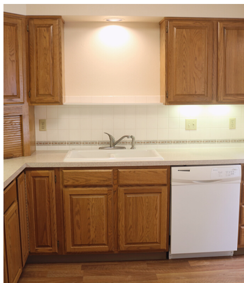
Select a new backsplash, and countertop. New upgraded appliances and fixtures included.