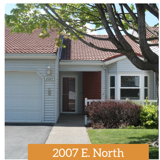
2007 E. North Crescent