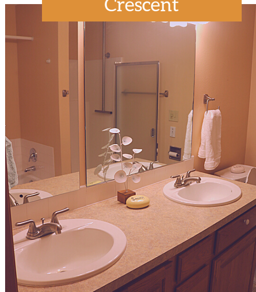
Double sinks in main bath, plus separate tub and walk in shower. Decide your paint color.