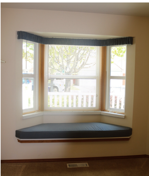
Choose new, bench cover and window coverings for this bay window, and pick new flooring.